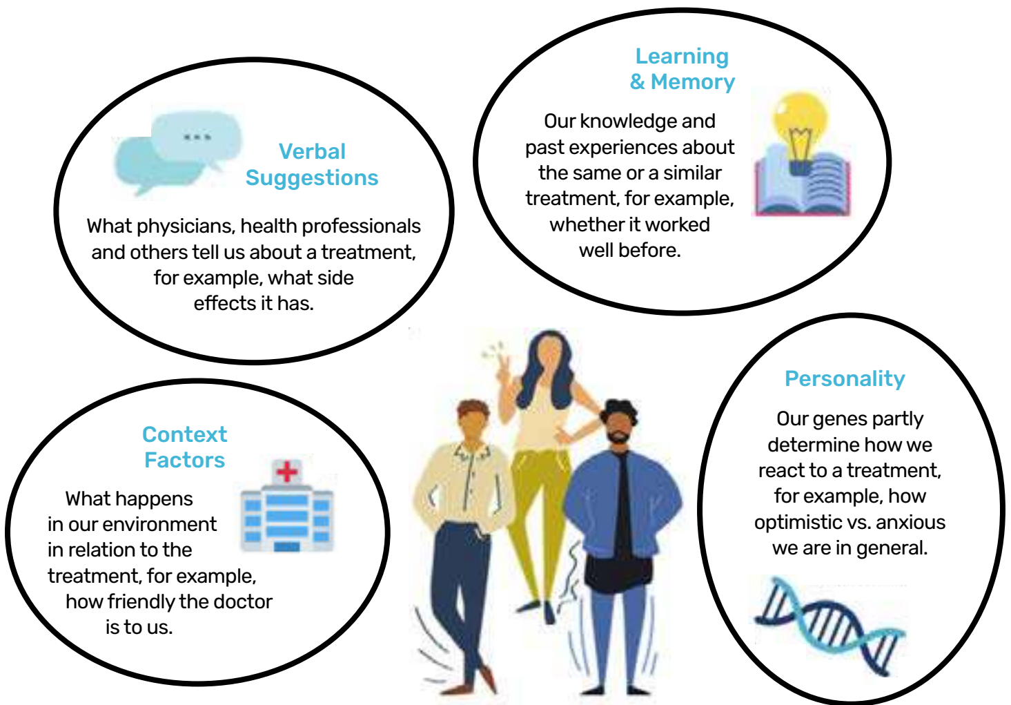
Figure 2. Patients' expectations about a certain treatment are shaped by various factors, such as verbal suggestions by physicians and health care professionals, the context in which information about the treatment is communicated, one's own knowledge, beliefs and past experiences with certain medication and treatments, and one's dispositional traits. This figure was created by the fact sheet authors using free designs in Canva ( https://www.canva.com/ ).